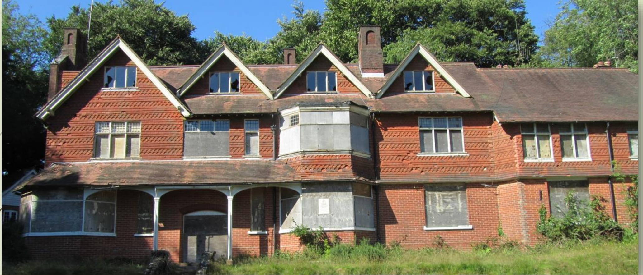
Undershaw Front Entrance