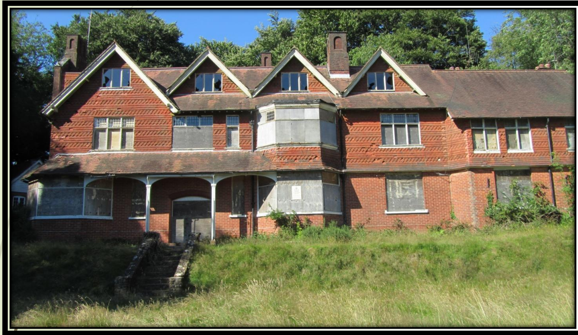
Condition in 2012